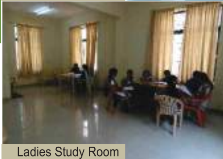
Ladies Study Room