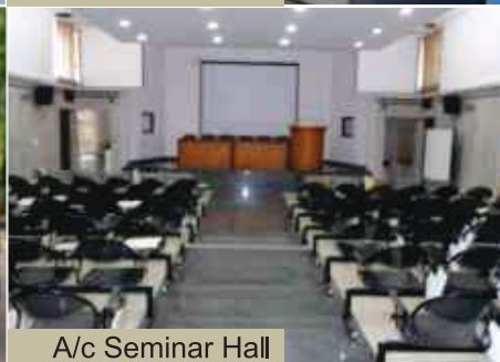
A/c Seminar Hall