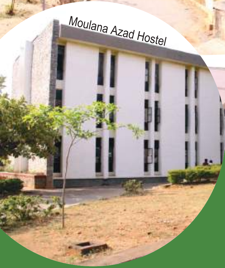
Moulana Azad Hostel