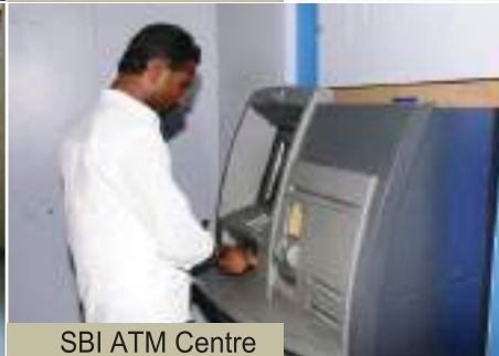
SBI ATM Centre